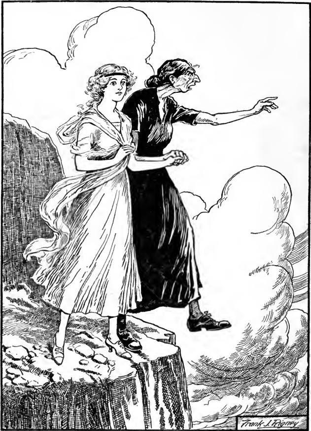
Innocence and Ignorance